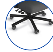
26" glass reinforced nylon base