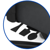
Plus Size Multi Tilt mechanism