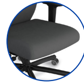
Dual curve polyurethane foam