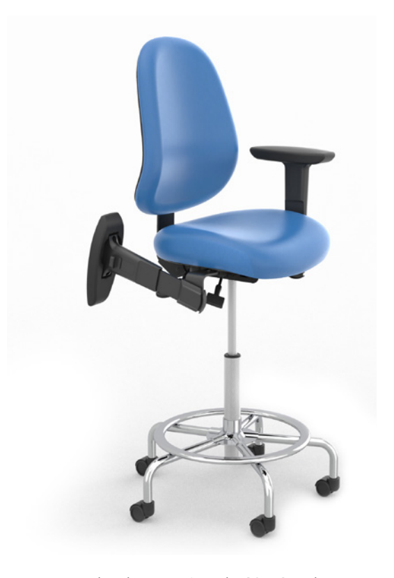
healtHcentric Lab C24 Stool