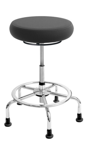
Ultimate Medical Stool