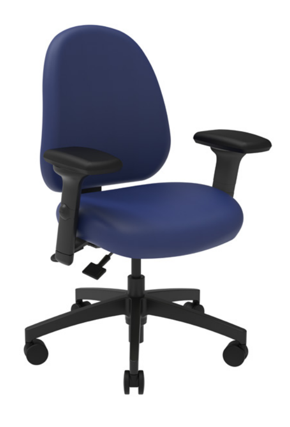
nurseCentric Dedicated Task Chairs

Investing in ergonomically designed chairs like the nurseCentric highlights a healthcare facility's commitment to the well-being of its nursing staff. These chairs help prevent fatigue and enhance comfort, leading to higher employee satisfaction. Satisfied employees are more likely to remain loyal, improving retention rates. Furthermore, when nurses are comfortable and free from discomfort, they can perform their duties more efficiently and with better focus. This not only benefits the nurses but also improves patient care quality, underscoring the importance of prioritizing nurse comfort and safety.