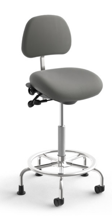
healtHcentric Sit Stand