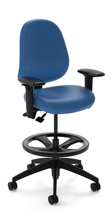
healtHcentric Lab FR Stool