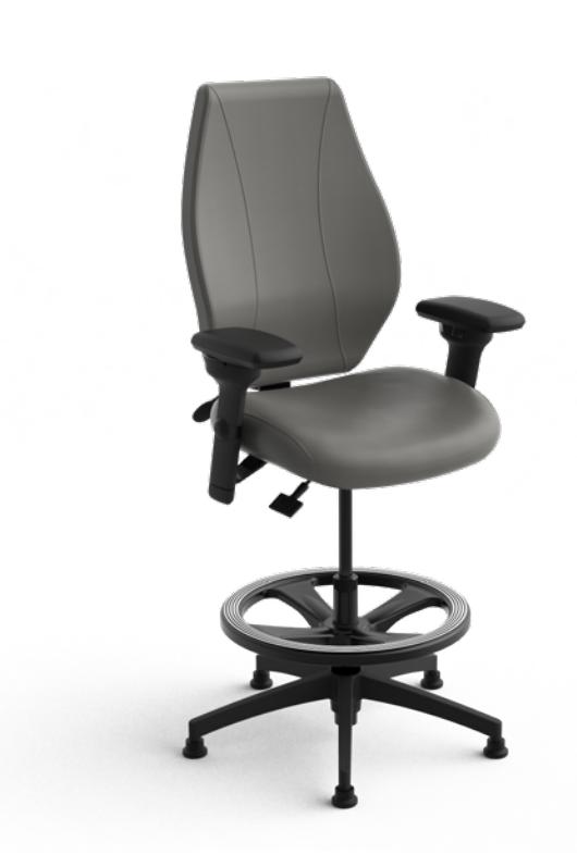
airCentric® H2S Lab Stool

Frixion™ - Medical grade upholstery healtHcentric.com 14 / 15 Frixion™ - Medical grade upholstery healtHcentric.com 15 / 15