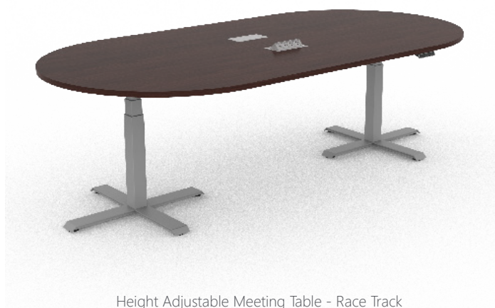
Height Adjustable Meeting Table - Race Track