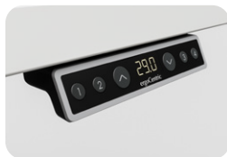
Pre-settable Memory Positions