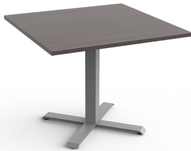
Small Fixed Height Meeting Table, 36" Square

Recognized as North America's premier manufacturer of high-quality ergonomic seating and workstations, our products are built to last and exceed the strength and stability standards.