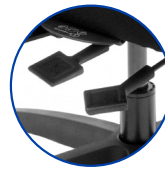
Wide range of adjustments available