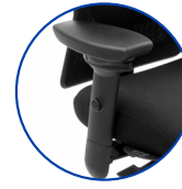
Multiple seat, caster and arm options