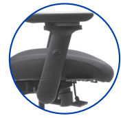
2 1/2" seat slider