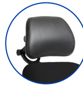
Adjustable headrest (optional)