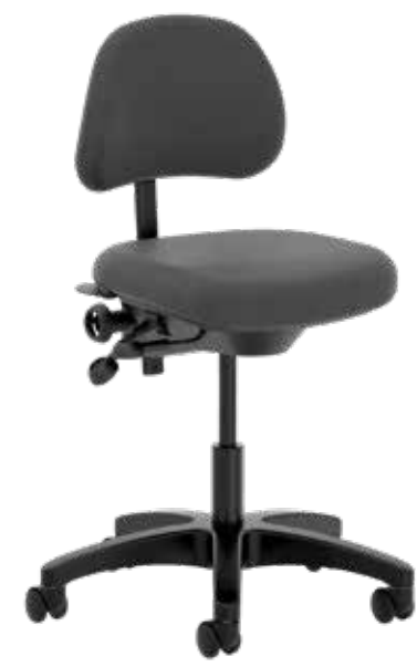
healthHcentric® Technician Stool