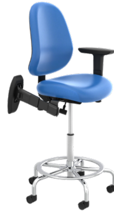
healthHcentric® Lab C24 Stool