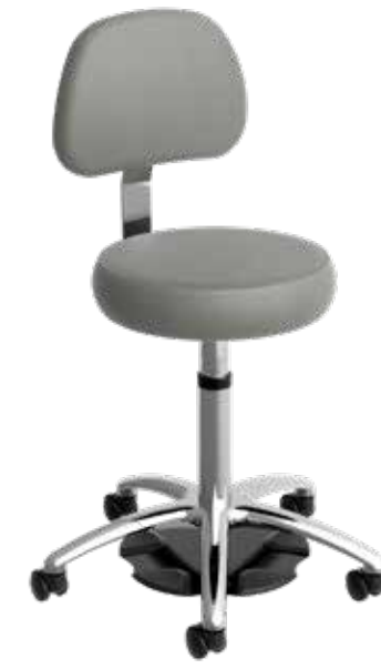
Ultimate Medical Stool