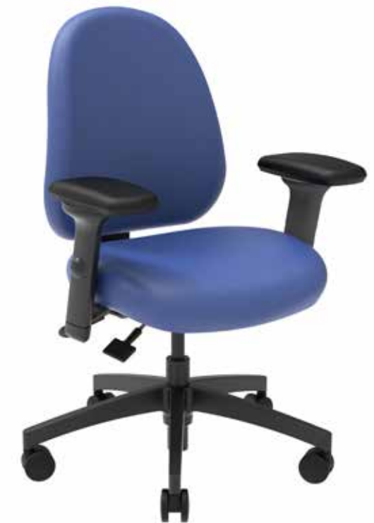
nurseCentric Task Chairs

Investing in ergonomically designed chairs like the nurseCentric highlights a healthcare facility's commitment to the well-being of its nursing staff. These chairs help prevent fatigue and enhance comfort, leading to higher employee satisfaction. Satisfied employees are more likely to remain loyal, improving retention rates. Furthermore, when nurses are comfortable and free from discomfort, they can perform their duties more efficiently and with better focus. This not only benefits the nurses but also improves patient care quality, underscoring the importance of prioritizing nurse comfort and safety.