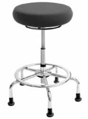
healthHcentric C22 Stool