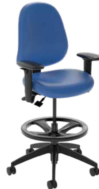
healthHcentric Lab FR Stool