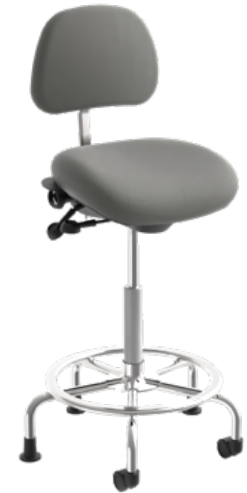
healthHcentric Sit Stand