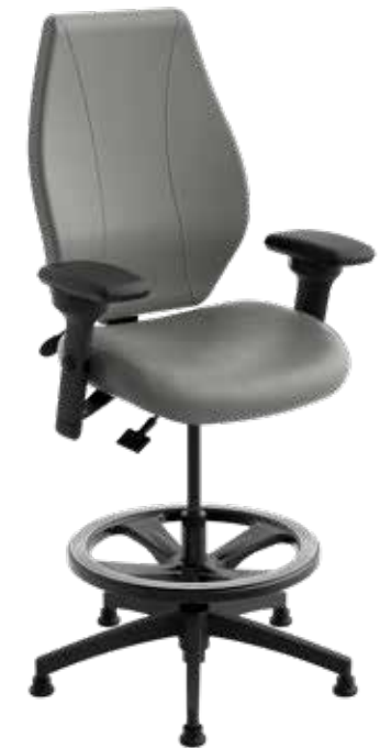
airCentric® H2S Lab Stool