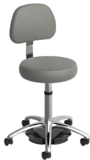
Ultimate Medical Stool