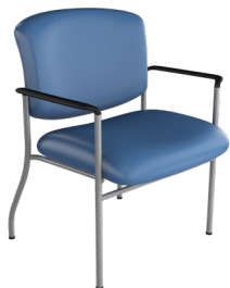
healthHcentric Guest Seating, 21", 24", 30"