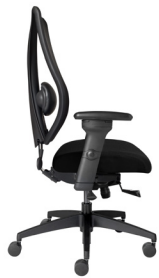
tCentric Hybrid boardroom chair