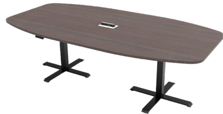
upCentric height adjustable conference table