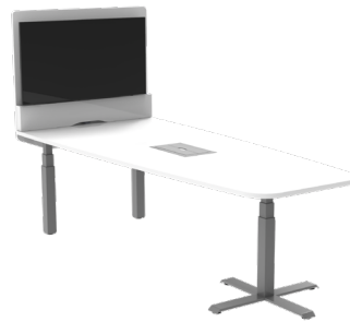
upCentric height adjustable video conferencing table