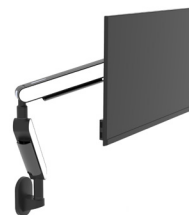
Zgonic Monitor Arm with wall mount