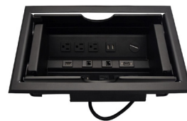
Power and data dock