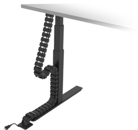
Cable management spine