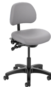
healthHcentric Technician Stool