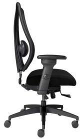
tCentric Hybrid boardroom chair