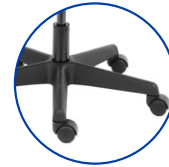
Multiple lift and caster options