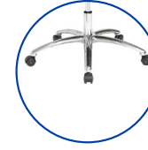
26" polished aluminium base