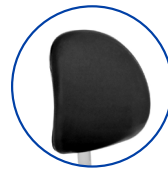
Dual curve backrest