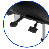
Wide range of adjustments available