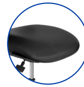
Dual density foam