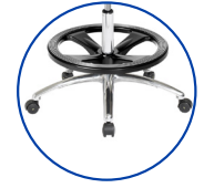
Footring available on ergo F ESD 200